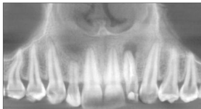
Figure 1. Panoramic reconstruction

The panoramic reconstruction revealed a morphologic alteration in the radicular portion of the maxillary lateral incisor and the presence of a slight periapical radiolucent lesion without sclerotic margins (Figure 1). The axial slices showed partial filling of the pulp chamber and canal with filling material and a second canal, located palatally, but without filling (Figures 2a-2c). Coronal slices showed an increase of the pulp chamber and periapical lesion causing destruction of the buccal bony plate, but without expanding it (Figures 3a-3c), as it could be represented in the virtual three-dimensional reconstruction (Figure 4). Based on these features the diagnosis of type III DI was stated.