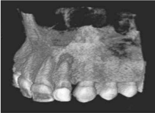
Figure 4. Virtual three-dimensional reconstruction in which the bony destruction could be seen